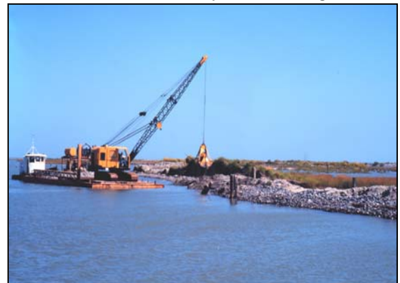
Clamshell bucket dredging operation.

SSFATE can be used as a quantitative assessment tool to define environmental time windows for dredging in sensitive areas. Environmental windows, intended to protect biological resources or their habitats, are requested during the interagency coordination process for dredging projects. Suspended sediments are a primary concern of resource agencies, as the exposure of aquatic organisms to elevated suspended sediment concentrations is perceived to be a major source of detrimental impact to those organisms. Likewise, re-deposition of suspended sediments can be a significant concern if sensitive bottom-dwelling organisms (e.g., oysters or sea grasses) are present in the vicinity of a dredging project. Accurate spatial predictions of dredge-induced suspended sediments is critical to establishing the need for protective windows.